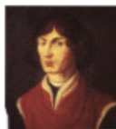
Nicholas Copernicus (c. 1473-1543) was a Polish astronomer, mathematician, and engineer. He is best known for his theory of heliocentrism, which placed the sun at the center of the universe. This theory was published in 1543 in his book 'De Revolutionibus Orbium Coelestium'.